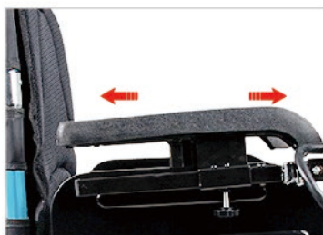
Armrest move forward and backward