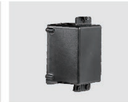
YSPLA11 12Ah Lead acid battery