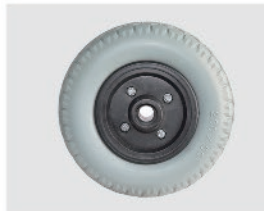
YSPW804 8" Heavy duty wheel