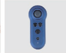
YSPCR001 Remote control