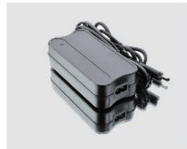
YSPCG212 YSPCG313 / YSPCG515 2A/3A/5A Charger