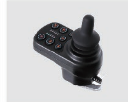
YSPC004 Controller (Reclining)