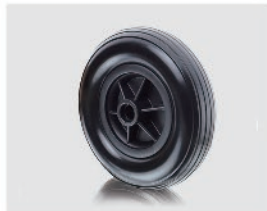
YSPW801 8" PU Solid wheel