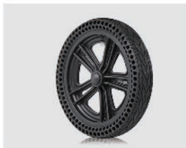
YSPW1204 12" Suspension wheel