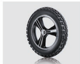
YSPW1206 12.5" PU Solid wheel