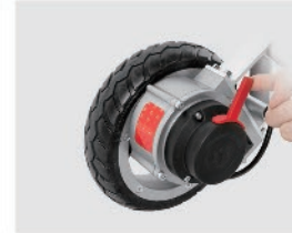
YSPM002 250 Brushless Motor