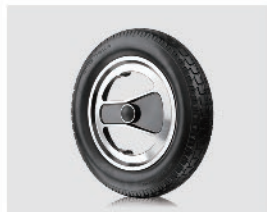
YSPW1202 12.5" PU Solid wheel