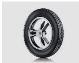
YSPW1205 12.5" PU Solid wheel