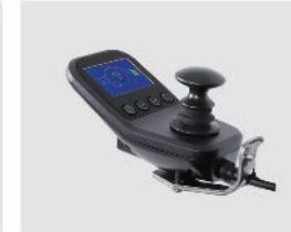
YSPC005 Controller (LED screen)