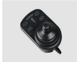
YSPC003 Controller (brushless)