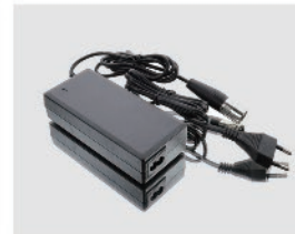
YSPCG203 2A Charger for Lead acid battery