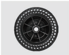
YSPW803 8" PU Solid wheel