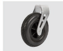
YSPW701 7" PU Solid wheel