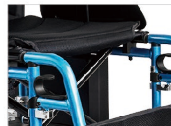
Swing away footrest